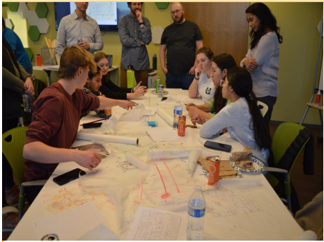
Collaboration on Floor Plans