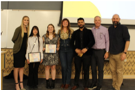
2023 Summer Camp Winners