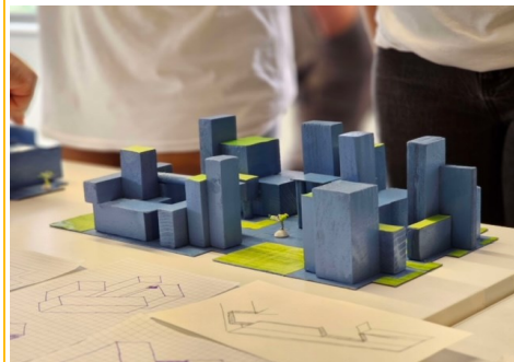
Summer Camp City & Design Sharing