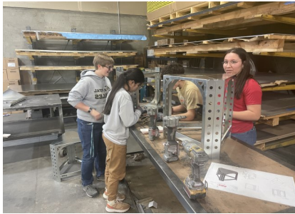
Trades Day making tables