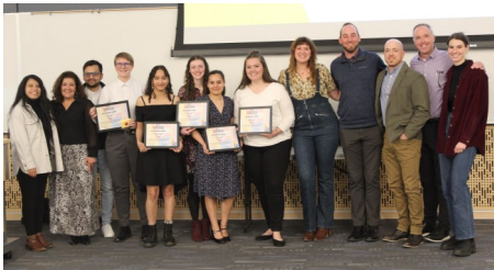
2023 Scholarship Winners