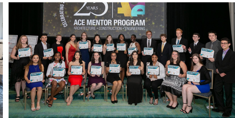
CMiC 2019 ACE Mentor National Scholarship Winners