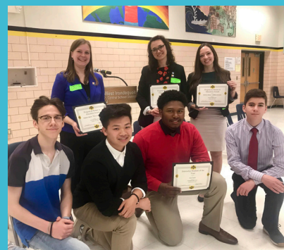
Our mentors received the Program & Partner in Education Award from Irondequoit High School at their Career Connection Awards!