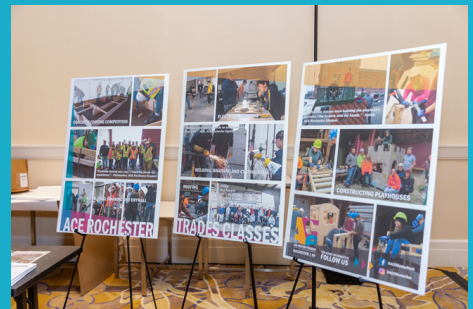
ACE Rochester presented our trades program at the All Affiliates Conference.