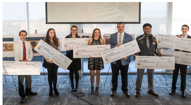
2019 ACE Mentor Program of Rochester Scholarship Winners

$29,000 in ACE Scholarships awarded in 2019.