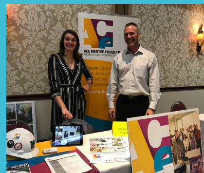
ACE Rochester was represented at this past year's Builders Exchange of Rochester Construction Career Day.