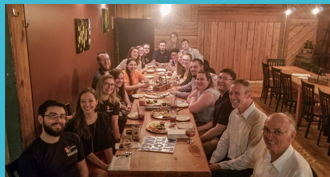
ACE Mentor Appreciation Happy Hour! We treated our mentors to a night out after a successful 2018-2019 program.